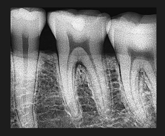
Trabecular bone structure is clearly visible