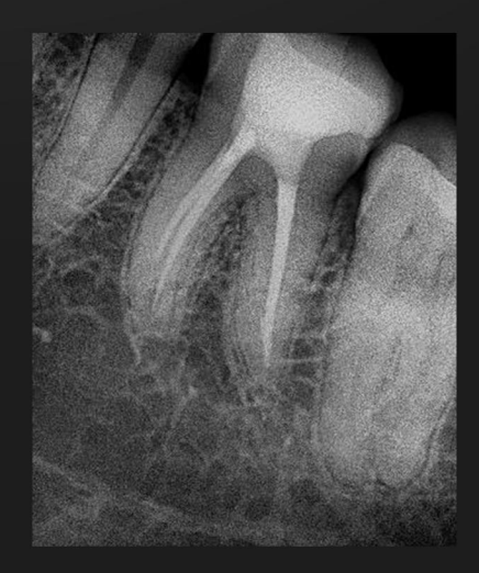
Periapical images after root canal filling

Dynamic range of 16 bits creates high quality images for accurate diagnosis