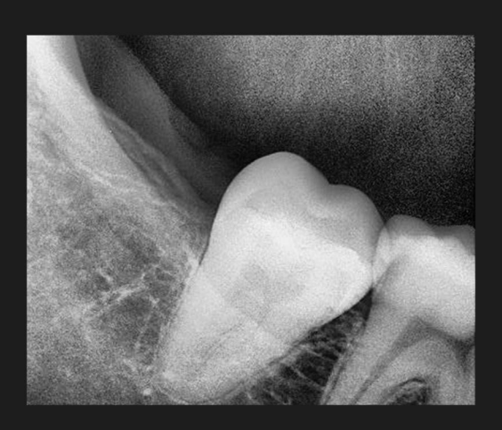
Perfect wisdom teeth structure image