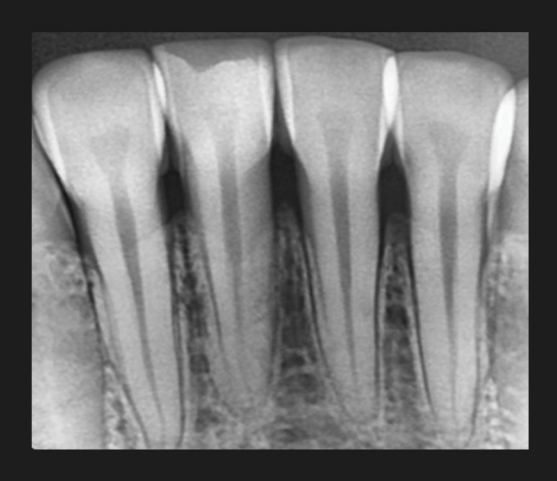
Periodontal ligament widening